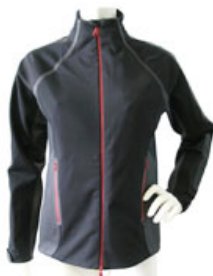
Kinetic Energy Wear

Grado Zero brings the Liquid Jacket , a retro 70's look motorcycling jacket made by ultra-thin leather, treated with Liquid Shell coating, making it UV and abrasion resistant while maintaining its softness and touch, and combined with a high thermal insulating material. The integration of the most advanced shock-absorbing system and an electroluminescent film brought to an increase in active and passive safety.